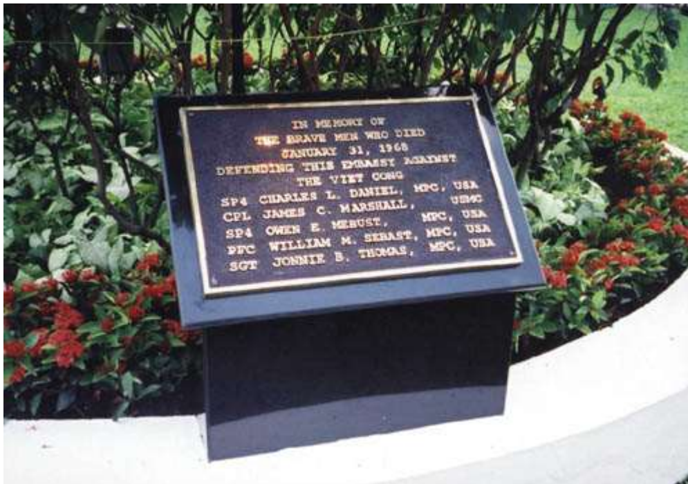
Plaque commemorating the Marine and Four MPs who died defending U.S. Embassy Saigon